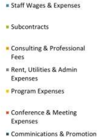
KBCSC 2020-2021 Expenses (Total $379,522)