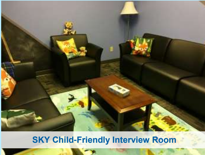
SKY Child-Friendly Interview Room

SKY faced many challenges this year due to the COVID-19 pandemic . Coordinators faced a reduction in referrals due to many children and their families sheltering in place. However, SKY Coordinators quickly adapted to working from home and were able to continue providing services. They also developed innovative ways of coordinating their MDTs to ensure services were collaborative during a time of physical distancing.