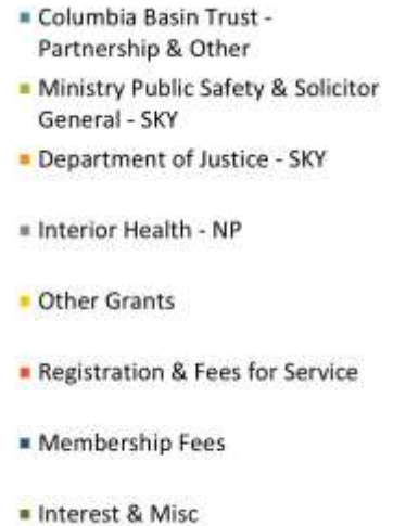
KBCSC 2020-2021 Revenue (Total $399,732)